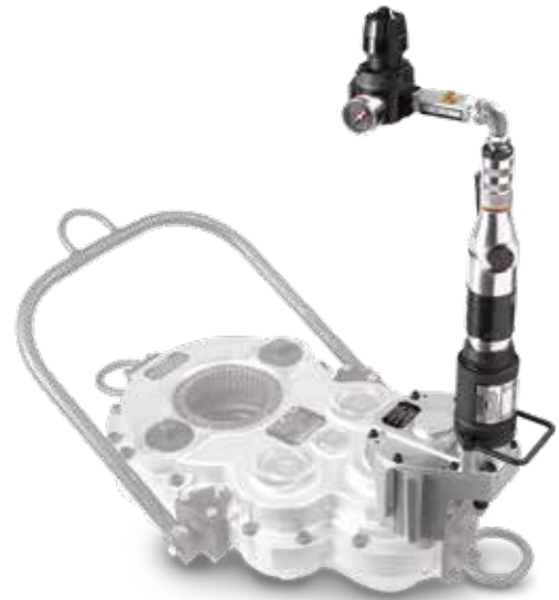
Model SWE8202A with Model SWE8300

NSN part number for the SWE8202A: 5130-01-211-2188