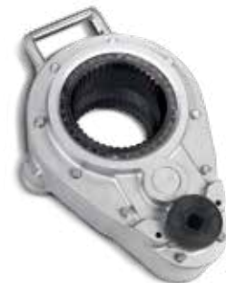
Model SWE8200/SWE8200 DS