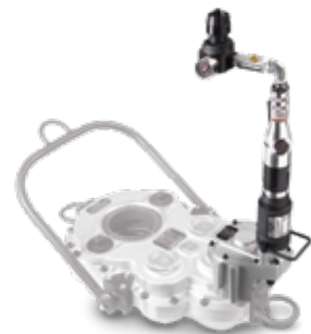
Model SWE8202A with Model SWE8300