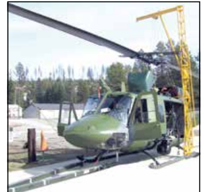
SWE13750 Tower Hoist

Sweeney CAGE Code: 87641 DUNS: 557305146