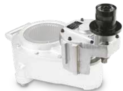
Model SWE8202-290A with Model SWE8200

NSN part number for the SWE8202-290A: 5120-01-364-9523