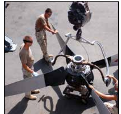
SWE8271 Lift in use