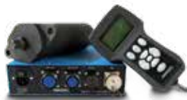
Turbine Engine Digital Turning Tool