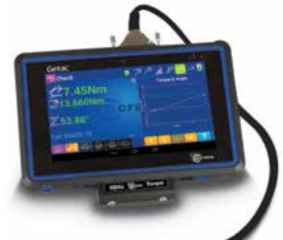
Check monitoring screen with relevant torque operation values