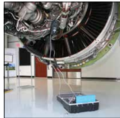
DTT motor installed on a gear box