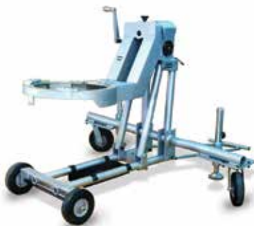
Military Ground Support Equipment & Custom Tooling